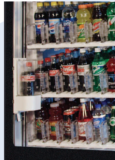
Rapid pick up mechanism