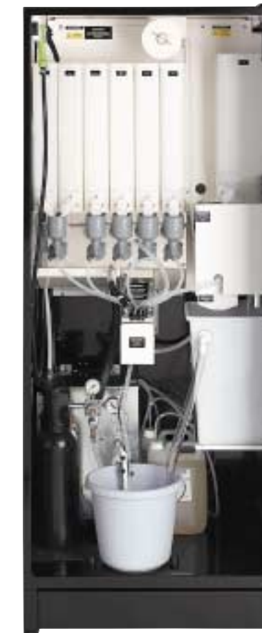
Riocca - Freshbrew